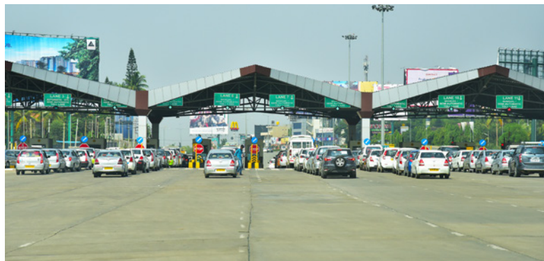
Toll in Karnataka.

The major Spanish companies that are already established in India in the field of road construction include Grupo San Jose , whose project to widen and improve the two-lane road section of 133 kilometres between the localities of Raebareli and Banda was inaugurated by no other than Prime Minister Modi at the end of 2018; or the company from Sevilla Ayesa , which