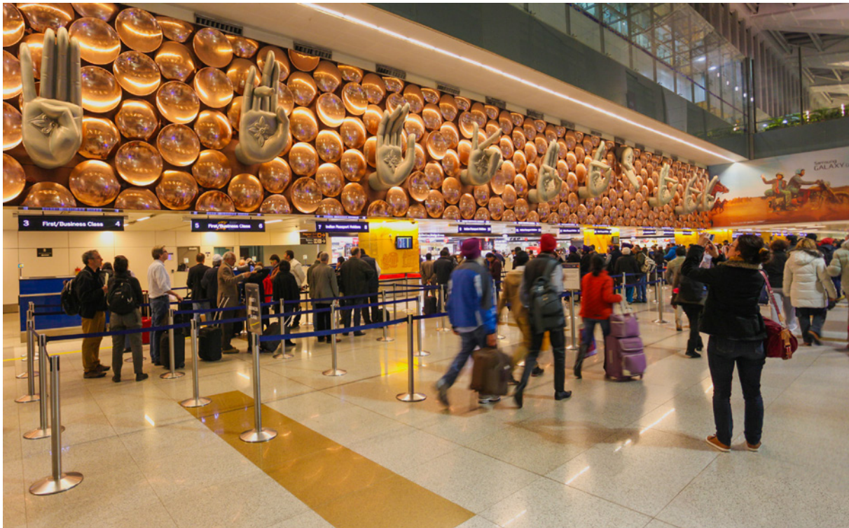
The transport infrastructure sector has experienced great expansion. In the image, Indira Gandhi Airport terminal in Delhi.

is the case of Spain. A new BTIA will be the key factor to offer legal security to investments and to promote the clearly deficient bilateral trade.