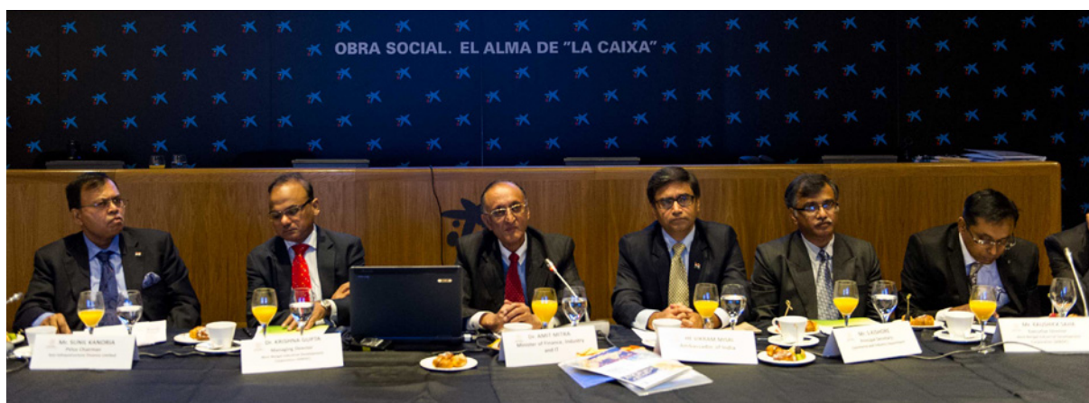
Meeting organized by the Spain-India Council Foundation with the Minister of Finance, Trade and Industry of the Indian state of West Bengal, Dr. Amit Mitra, in October 2015